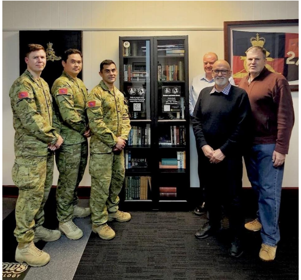
Bty and Committee Members at the Brothers' and Books Launch

Another busy period for the Association as outlined above as well as our other projects in full swing: The re-vamping of the JARKS Club housing our memorabilia and the Victorian Gunnery History by Stories designed to supplement Action! Action! Action. I look forward in meeting with you in the near future at either the book launch or maybe swapping a book at the Bty.