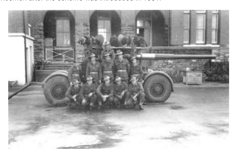
National Servicemen from 24 HAA Regiment, RAA, with a 3.7 inch anti-aircraft gun on the parade ground at Artillery Barracks 1954

By 1950 missile and aircraft technology had made coastal guns redundant as a form of defence. The guns were put on a "care and maintenance" basis (all guns except Oliver Hill were removed in 1963) and the barracks by the early 1950s no longer housed soldiers. The former dormitories became lecture rooms for units of the Citizen Military Forces (CMF) bolstered by the numbers of National Servicemen after the scheme was introduced in 1951.