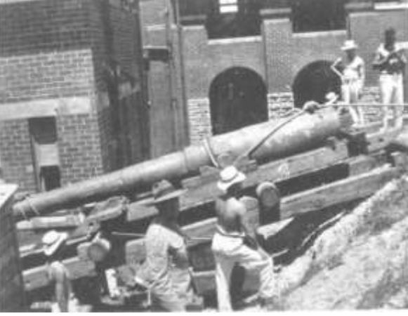
Gunners from 6th Heavy Battery on parade c 1930s a coast gun (Armstrong MkIII) at the rear of