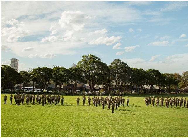
On Parade at Victoria Barracks Paddington