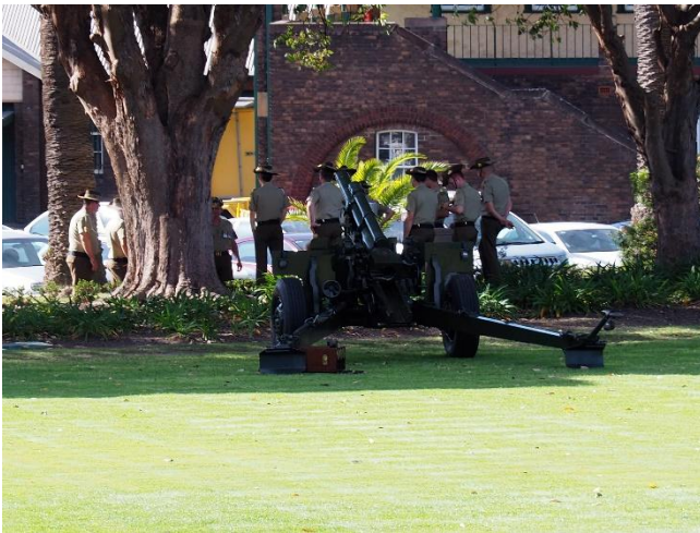
Hurry UP and Wait