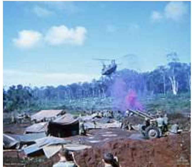
A US Army CH-47 Chinook at FSB Coral, 12 May 1968

The Australian Army's employment of fire support bases in South Vietnam was very successful and all attacks by the enemy on 1 ATF's bases were repelled and defeated, with the most famous attack being that on FSPB 'Coral' in May 1968. However,